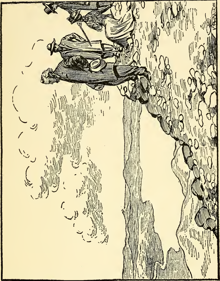
BRIGHAM YOUNG'S FIRST VIEW OF THE GREAT SALT LAKE.